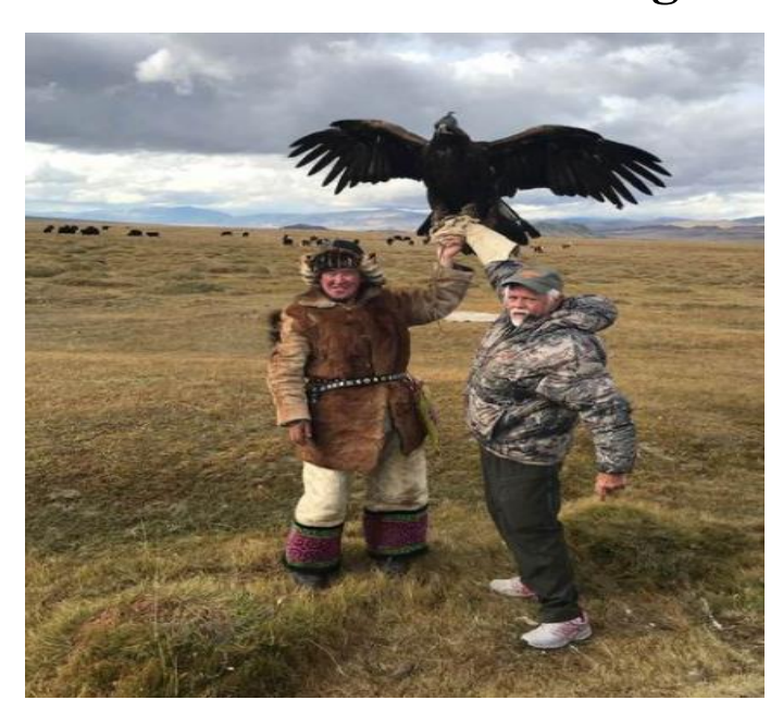
Your legacy lives on....

Your smile was bright, your voice was loud, You made everyone feel important even in a big crowd. You weren't shy by any means, Yet you were really a superhero behind the scenes. You'd distract them all with you banter and wit, While secretly teaching them bit by bit. You worked hard and gave well, Giving secretly so no one could tell. You loved to hunt big exotic game, You were smart and kind, treating everyone the same. You were called a rebel, who blazed his own trail, But still a regular guy with a story to tell. Some say you're a legend, bigger than life, You loved your family and especially your wife. You'll always be remembered though you could not stay, Your legacy lives on each and every day.